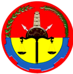
የትግራይ ክልል ከተማ ልማት፣ ንግድና ኢንዱስትሪ ቢሮ Tigray Bureau of Urban Development, Trade and Industry