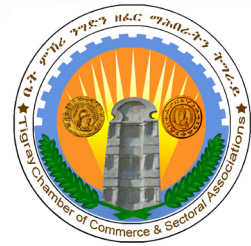
የትግራይ የንግድና የዘርፍ ማህበራት ም/ቤት Tigray chamber of Commerce & Sectoral Association