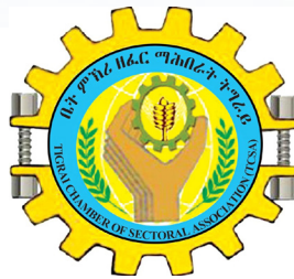
ትግራይ ክልል የዘርፍ ማኅበራት ምክር ቤት Tigray Chamber of Sectoral Association